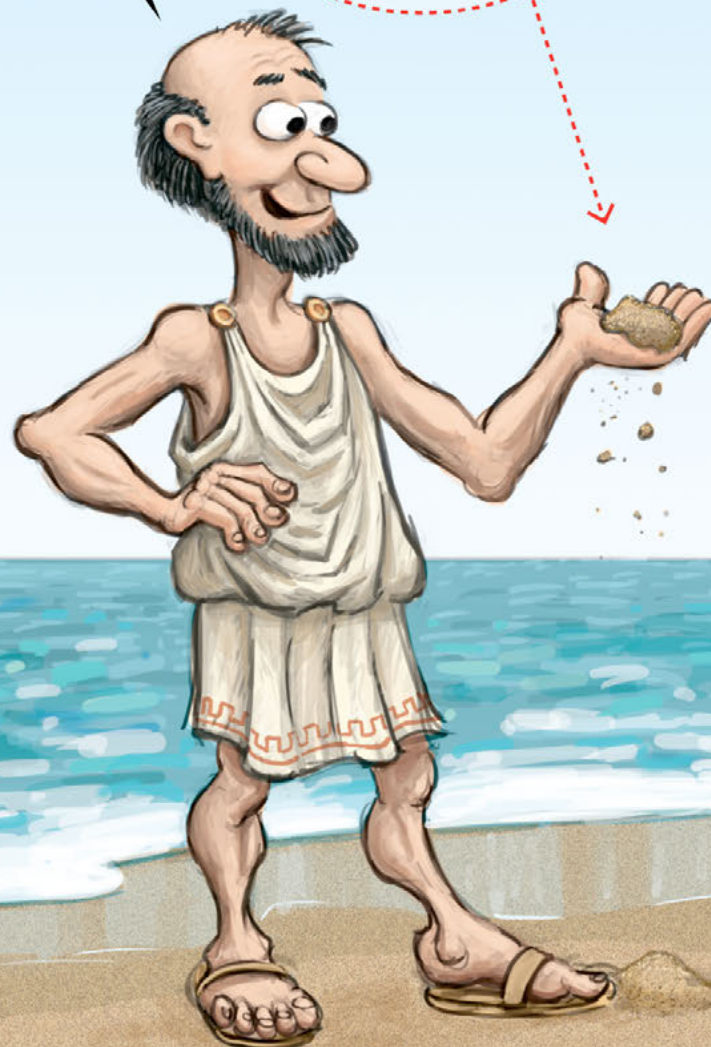
DEMOCRITUS, 460 - 370 B.C.

OH, DON'T BE SO CRABBY. MAYBE IN A COUPLE THOUSAND YEARS PEOPLE WILL GET AROUND TO LOOKING AT EVIDENCE...