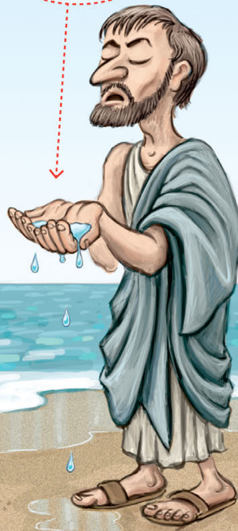
ARISTOTLE, 382 - 322 B.C.